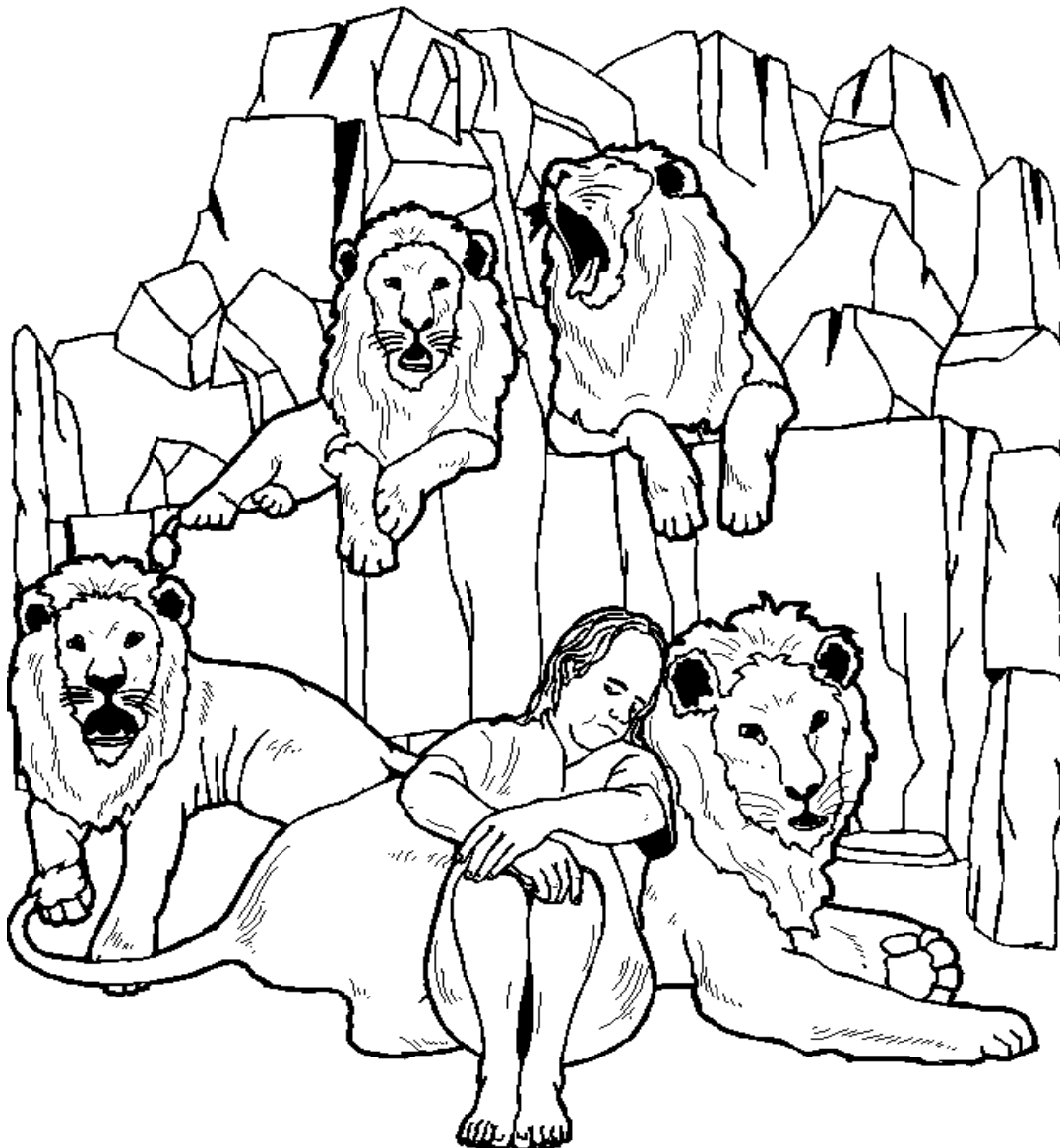
Daniel also refused to worship other gods. One time he was arrested for praying and was thrown into a den of hungry lions. God protected Daniel and he was not hurt by the lions.

“Every time we think of you, we thank God, and pray for you with prayers of joy. For God began a good work in you, and will complete that work in years to come.”